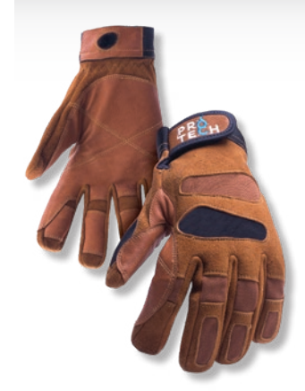
Now Available in Oiled Goat Leather (Black or Brown)