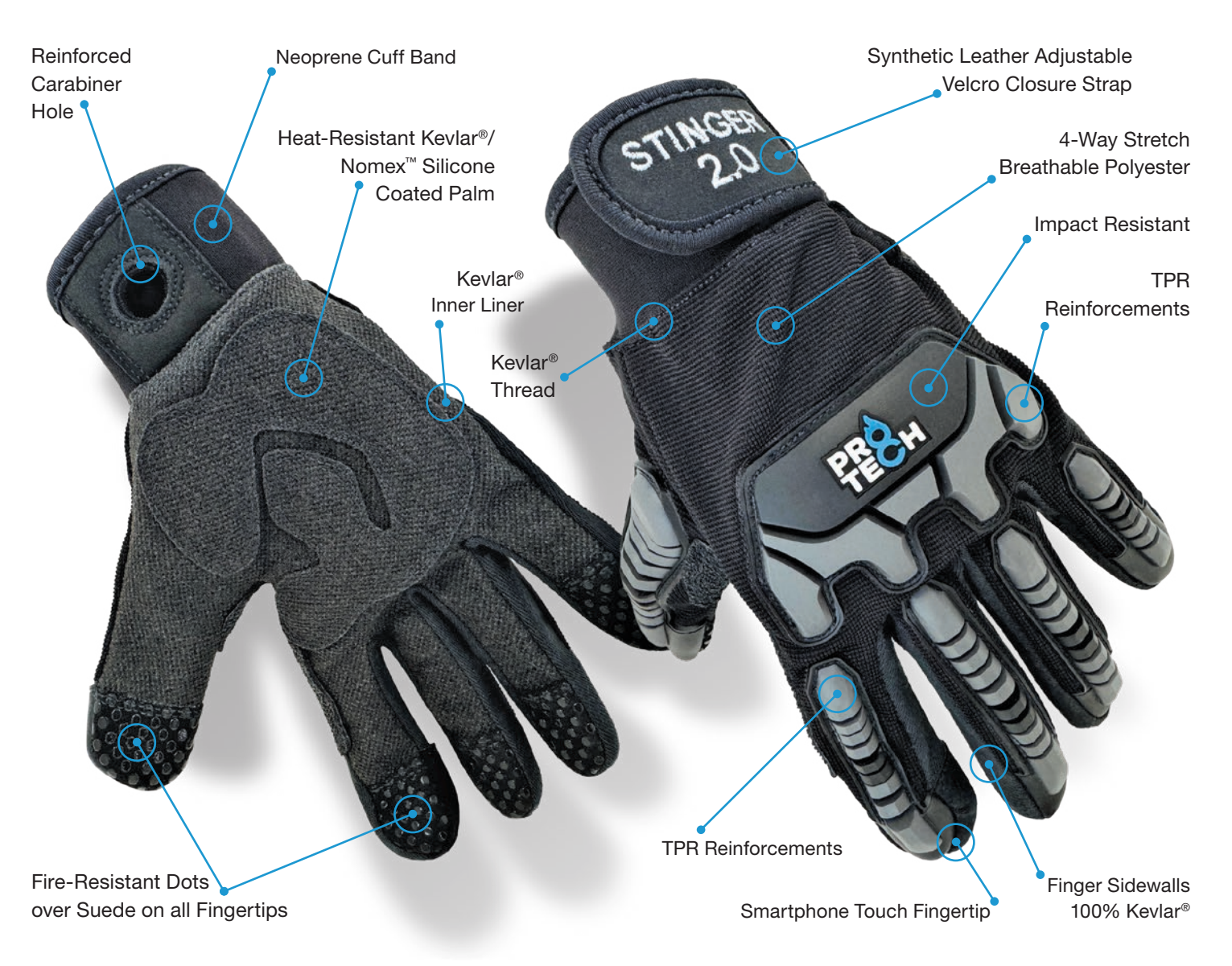
Pro-Tech 8 Stinger 2.0: Model # PT-8 STR 2.0, Sizes: S-2XL